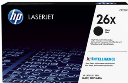
Original HP Toner cartridge with JetIntelligence

Bring out the best in your MFP. Print more consistent, high-quality pages than ever before, 2 using specially designed Original HP Toner cartridges with JetIntelligence. Count on better performance, higher energy efficiency, and the authentic HP quality you paid for—something the competition simply can't match. 2