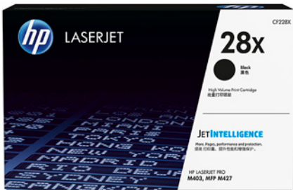
Original HP Toner cartridge with JetIntelligence

Bring out the best in your MFP. Print more consistent, high-quality pages than ever before, 2 using specially designed Original HP Toner cartridges with JetIntelligence. Count on better performance, higher energy efficiency, and the authentic HP quality you paid for—something the competition simply can't match. 2