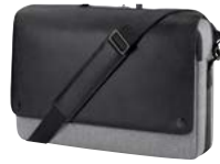
HP Executive Messenger 15.6"