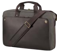
HP Executive Top Load (brown) 15.6"