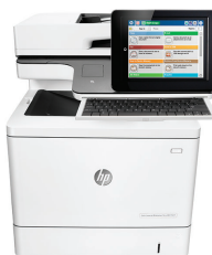
HP Color LaserJet Enterprise Flow MFP M577c