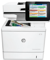
HP Color LaserJet Enterprise MFP M577dn

Ideal for enterprises and medium businesses that need a secure, highly productive, energy-efficient color MFP.