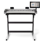
HP HD Pro 42-in Scanner