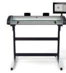
HP SD Pro 44-in Scanner