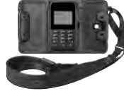
Shown with optional HP Shoulder Strap 3