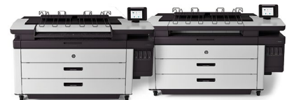
HP PageWide XL 4000 Printer series Do the work of two printers with one—faster and lower cost than LED 15