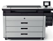
HP PageWide XL 8000 Printer The fastest large-format monochrome and color printer ever, with up to 50% savings in total production costs 1