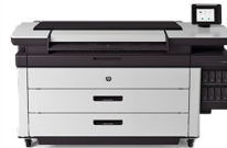
HP PageWide XL 5000 Printer Powerful, efficient monochrome and color production with up to 30% savings in total production costs 14