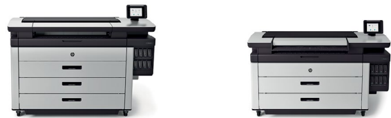
HP PageWide XL blueprinters 17

Powerful black-and-white and digital blueprint production