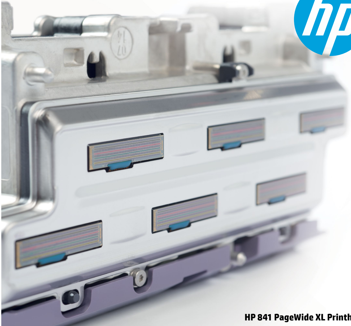
HP 841 PageWide XL Printhead