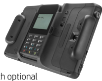
Shown with optional Verifone e355 1