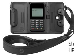
Shown with optional HP Shoulder strap 2