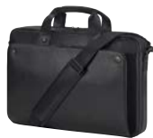
HP Executive Black Leather Top Load 17.3"