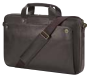
HP Executive Brown Leather Top Load 17.3"