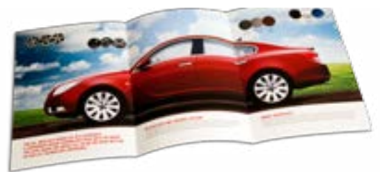
High productivity for large-sized marketing collateral.

PrintOS. Print Beat provides visibility to press performance to drive continuous improvement to print operations. PrintOS Site Flow efficiently manages any number of jobs per day, even hundreds or thousands. Automate, simplify and streamline files submission with PrintOS Box. Use PrintOS Composer for heavy VDP processing including sophisticated HP SmartStream Mosaic campaigns.