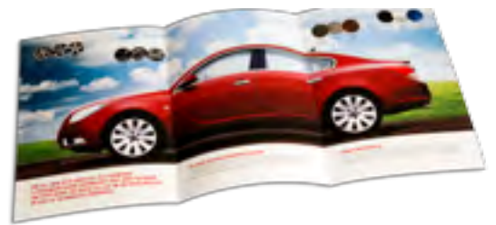
High productivity for large-sized marketing collateral.

PrintOS. Print Beat provides visibility to press performance to drive continuous improvement to print operations. PrintOS Site Flow efficiently manages any number of jobs per day, even hundreds or thousands. Automate, simplify and streamline files submission with PrintOS Box. Use PrintOS Composer for heavy VDP processing including sophisticated HP SmartStream Mosaic campaigns.