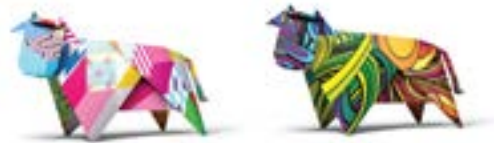
HP SmartStream Mosaic one-of-a-kind designs.