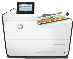
HP PageWide Enterprise Color 556dn