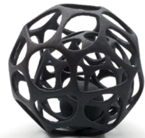
Picture taken after dye post-processing

Robust thermoplastic that optimizes part quality with cost, producing strong structures