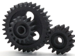
Picture taken after dye post-processing

Get precise small features and detail such as small fine holes, walls and shafts with dimensional accuracy thanks to HP's unique Multi-Agent printing process