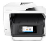
HP OfficeJet Pro 8720 (D9L19A)

Print speed up to 24/20 ppm (black/color, letter and A4, simplex) 12