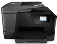
HP OfficeJet Pro 8710 (D9L18A)

Choose the HP OfficeJet Pro that's the right fit for your office