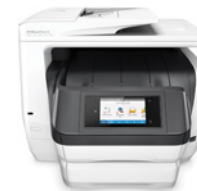
HP OfficeJet Pro 8710 (M9L66A)