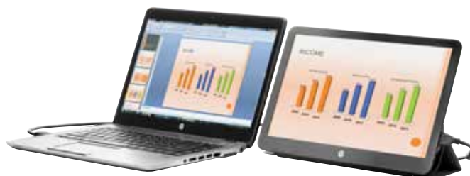
HP S140u Portable Monitor

Give your mobile workers an advantage in the office. They can pair their on-the-go PC with all the extra screen space they need at their desk—simply connect their notebook via a docking station or create an instant multi-screen workspace with a USB cable and the HP EliteDisplay S231d Docking Monitor.