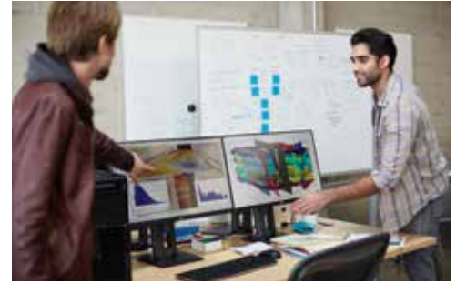
HP Ultra-Narrow Bezel Z Displays

Maximise your content and fit more information on-screen without losing clarity. The ultra-high resolution of 5K, 4K, and Quad-HD displays means more pixels for sharper images and fonts—providing a more realistic depiction of images onscreen.