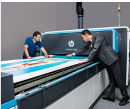
HP Scitex 17000 Corrugated Press