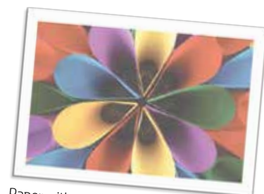
Paper without ColorLok® Technology