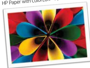
HP Paper with ColorLok® Technology