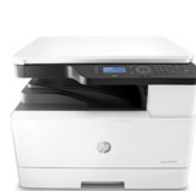
HP LaserJet MFP M436n