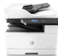
HP LaserJet MFP M436nda