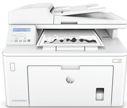
HP LaserJet Pro MFP M227sdn

Get more pages, performance, and protection from an HP LaserJet Pro MFP powered by JetIntelligence Toner cartridges. Set a faster pace for your business: Print two-sided documents, plus scan, copy, fax 15 , and manage to help maximize efficiency.