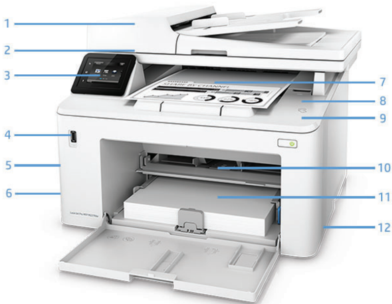
HP LaserJet Pro MFP M227fdw