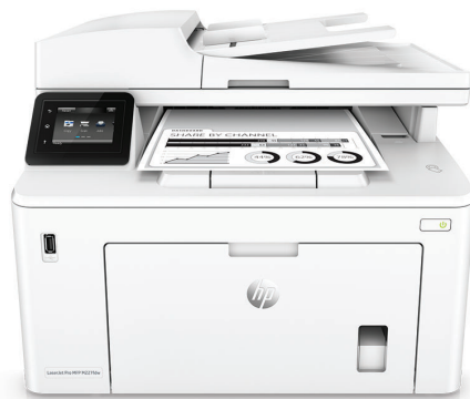
HP LaserJet Pro MFP M227fdw