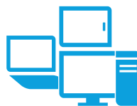
Attached peripherals, including monitors, docking stations, keyboards, and mice

Sign up for updates hp.com/go/getupdated