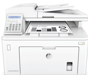
HP LaserJet Pro MFP M227fdn

Get more pages, performance, and protection from an HP LaserJet Pro MFP powered by JetIntelligence Toner cartridges. Set a faster pace for your business: Print two-sided documents, plus scan, copy, fax, and manage to help maximize efficiency.