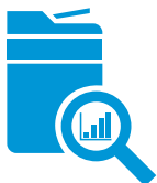
HP JetAdvantage Insights Icon