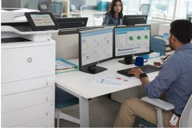
Lifestyle photo 2 – https://hpscassets.blob.core.windows.net/solutions/JetAdvantageInsights2.jpg