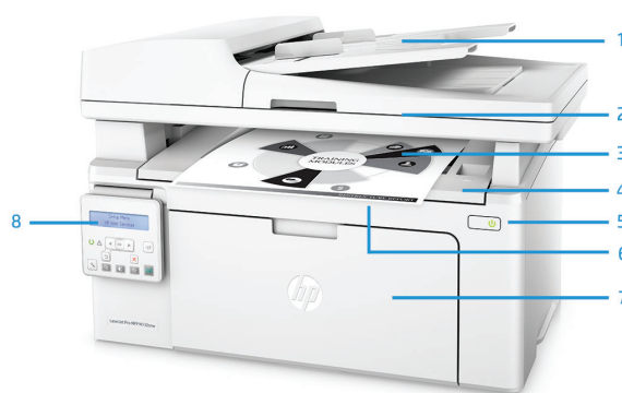
HP LaserJet Pro MFP M132snw