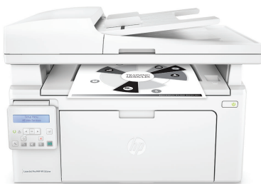
HP LaserJet Pro MFP M132snw