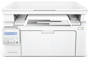
HP LaserJet Pro MFP M132nw