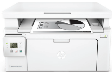
HP LaserJet Pro MFP M132a

Print professional documents from a range of mobile devices, 1 plus scan, copy, and help save energy with a wireless MFP designed for efficiency.