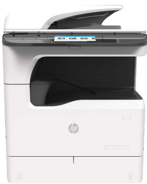
HP PageWide Managed P75050 / P77750 MFP

#1 HP's customer satisfaction rating as the most recommended MPS provider 1