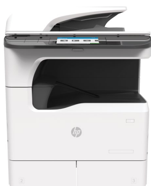
HP PageWide Managed P75050/P77750 MFP

HP Managed Print Services (MPS) provides you with access to the expertise and support your customers' need to help manage their printing environment efficiently and effectively. Our comprehensive portfolio, scalable solutions, and data analytics help predict cost, increase uptime, and improve security. Plus, you'll be able to provide customers with the scalability and flexibility to make changes as their business needs evolve.