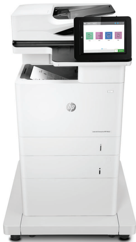
HP LaserJet Enterprise MFP M632ft