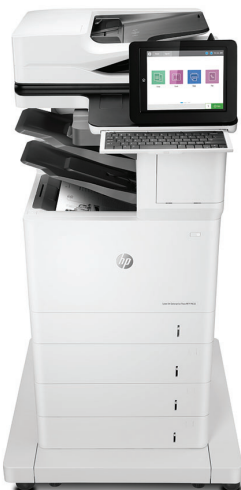
HP LaserJet Enterprise Flow MFP M632z