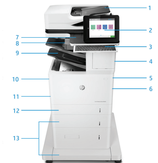
HP LaserJet Enterprise Flow MFP M632z shown