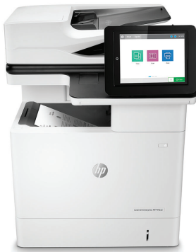
HP LaserJet Enterprise MFP M632h

This HP LaserJet MFP with JetIntelligence combines exceptional performance and energy efficiency with professional-quality documents right when you need them—all while protecting your network from attacks with the industry's deepest security. 1