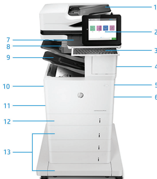
HP LaserJet Enterprise Flow MFP M632z shown