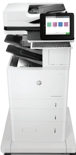
HP LaserJet Enterprise Flow MFP M632z