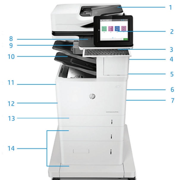
HP LaserJet Enterprise Flow MFP M633z shown