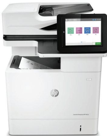
HP LaserJet Enterprise MFP M633fh

This HP LaserJet MFP with JetIntelligence combines exceptional performance and energy efficiency with professional-quality documents right when you need them—all while protecting your network from attacks with the industry's deepest security. 1