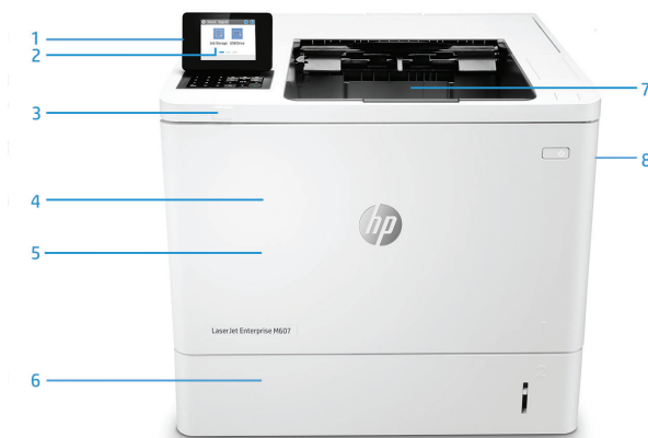
HP LaserJet Enterprise M607dn