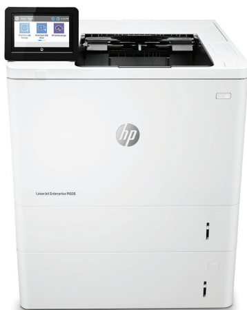
HP LaserJet Enterprise M608x