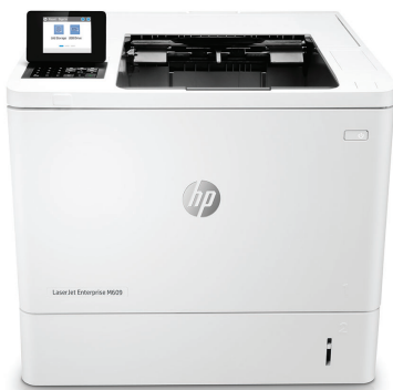
HP LaserJet Enterprise M609dn

This HP LaserJet Printer with JetIntelligence combines exceptional performance and energy efficiency with professional-quality documents right when you need them—all while protecting your network from attacks with the industry's deepest security. 1