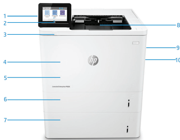
HP LaserJet Enterprise M609x