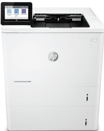
HP LaserJet Enterprise M609x