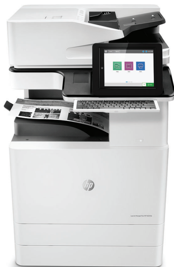
HP LaserJet Managed Flow MFP E82540z