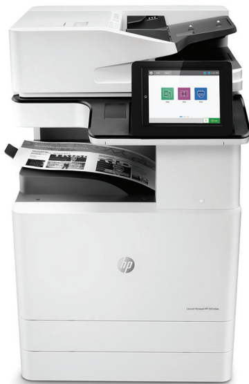
HP LaserJet Managed MFP E82540dn

Businesses that stay ahead don't slow down. It's why HP built the next generation of HP LaserJet MFPs—to power productivity with a streamlined design that delivers premium quality, maximum uptime, and the strongest security. 1