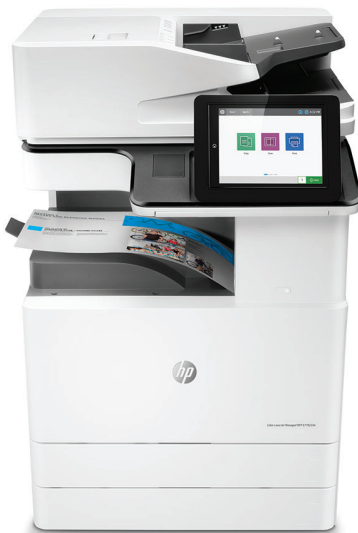
HP Color LaserJet Managed MFP E77822dn

Businesses that stay ahead don't slow down. It's why HP built the next generation of HP Color LaserJet MFPs—to power productivity with a streamlined design that delivers premium color value, maximum uptime, and the strongest security. 1