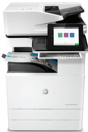
HP Color LaserJet Managed Flow MFP E77822z