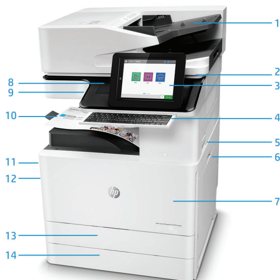
HP Color LaserJet Managed Flow MFP E87660z