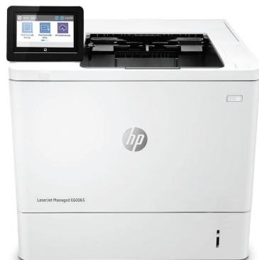
HP LaserJet Managed E60065x