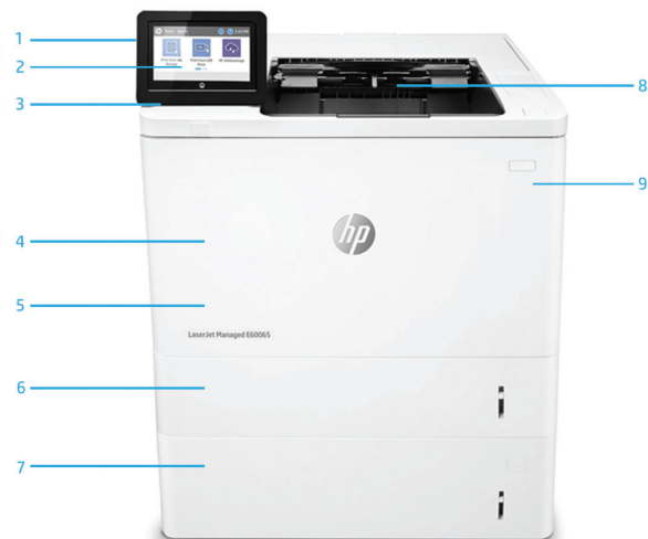
HP LaserJet Managed E60065x shown