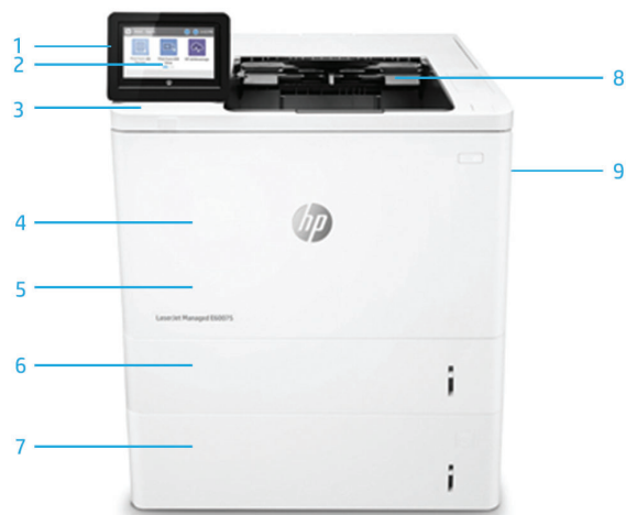
HP LaserJet Managed E60075x shown