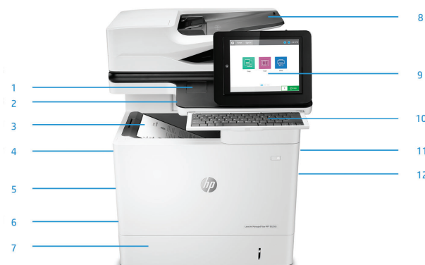
HP LaserJet Managed Flow MFP E62565h shown