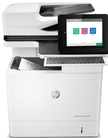
HP LaserJet Managed Flow MFP E62565h