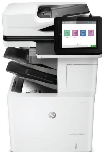
HP LaserJet Managed MFP E62565hs

This HP LaserJet MFP with JetIntelligence combines exceptional performance and energy efficiency with professional-quality documents right when you need them—all while protecting your network from attacks with the industry's deepest security. 1