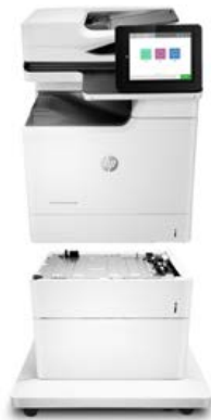
550-sheet Paper Feeder with Stand and Cabinet (P1B10A)