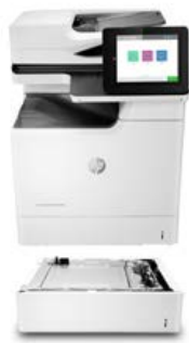
550-sheet Paper Feeder (P1B09A)