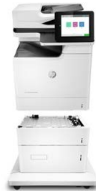
1x550-sheet/2,000-sheet HCI Feeder and Stand (P1B12A)