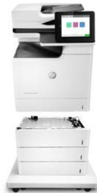
3x550-sheet Paper Feeder and Stand (P1B11A)