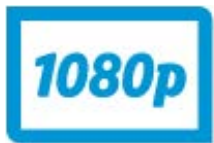
Full HD Resolution