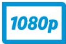
Full HD Resolution