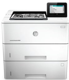
HP LaserJet Enterprise M506xm