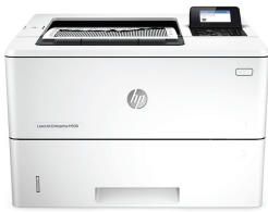
HP LaserJet Enterprise M506dnm

HP Managed MFPs and printers are optimized for managed environments. Offering increased monthly page volumes and fewer interventions, this portfolio of products can help reduce printing and copying costs. See your HP Authorized Reseller for details.