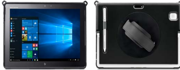
HP Elite x2 1012 G2 Protective Case