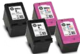
HP 304 and 304XL Original ink cartridges

1 Wireless operations are compatible with 2.4 GHz and 5.0 GHz operations only. Learn more at hp.com/go/mobileprinting . Wi-Fi® is a registered trademark of Wi-Fi Alliance®.