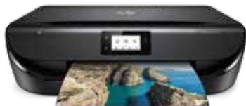
HP ENVY 5030 All-in-One

To order the HP ENVY 5030 All-in-One series and supplies, please go to hp.com . To contact HP by country, please visit hp.com/go/contact .