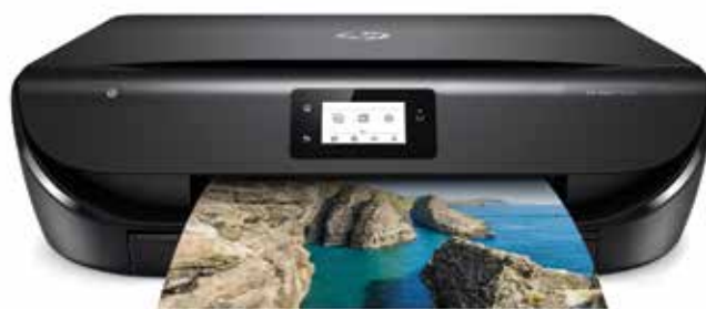
HP ENVY 5030 All-in-One