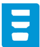
Displayport, HDMI, VGA