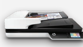
HP recommended scanner: HP ScanJet Pro 4500 fn1

"It sits in our office and is linked directly to my computer, but I can share it with my colleagues."