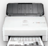
HP recommended scanner: HP ScanJet Pro 3000 s3

"Having a standalone scanner is pretty amazing; it means I don't have to compete with anyone."