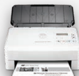
HP recommended scanner: HP ScanJet Enterprise Flow 7000 s3

"My scanner helps me every day. It is very handy. For me to get up multiple times a day would be really cumbersome."