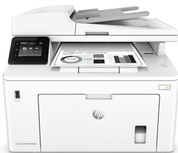
HP LaserJet Ultra MFP M230fdw