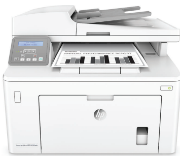
HP LaserJet Ultra MFP M230sdn

Take advantage of ultra-low printing costs with an efficient HP LaserJet Ultra MFP and enough toner to print up to 15,000 pages. 1 Produce consistent, professional two-sided documents at print costs attractive for the price conscious customers.