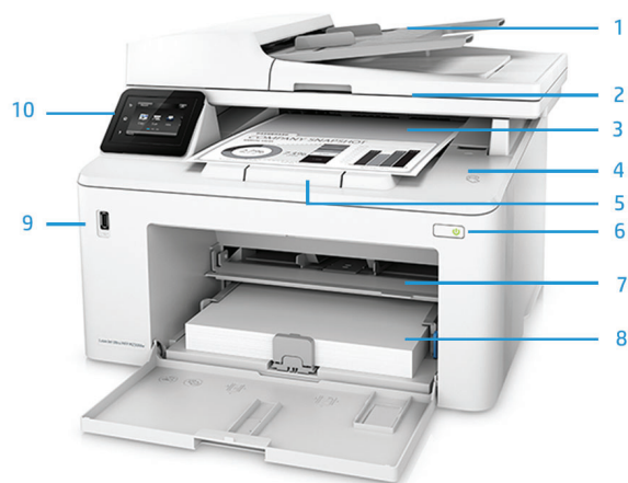
HP LaserJet Ultra MFP M230fdw