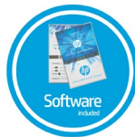
HP FlexiPRINT and CUT RIP