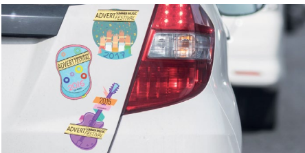
LABELS AND STICKERS