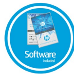
HP FlexiPRINT and CUT RIP