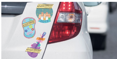
LABELS AND STICKERS