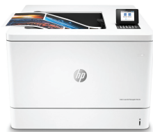
HP Color LaserJet Managed E75245dn

HP LaserJet printers power office productivity with a smart, streamlined design that's reliable and hassle-free. Count on premium quality, maximum uptime, and the strongest security—all intended to drive successful organizations forward.